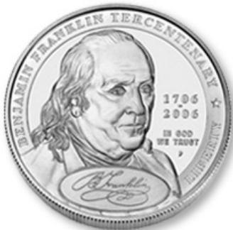
In 2006 the U.S. Mint issued a limited commemorative coin to celebrate the tercentenary of Benjamin Franklin's birth, (Jan 17, 1706)