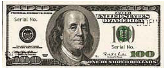
In recognition of his contribution to the United States, Benjamin Franklin's likeness appears on the highest circulating denomination: $100 bank notes.

No matter which sphere of American life you look at - be it culture, economy, politics or technology - you are bound to come across Benjamin Franklin's name. The topic of money is no different. Here, too, he made his contribution. His printing company, which printed colonial bank notes, strove towards assuring safety as far back as 1739. To discourage counterfeiting of the original money, complicated patterns of leaves were used in the design of the notes.